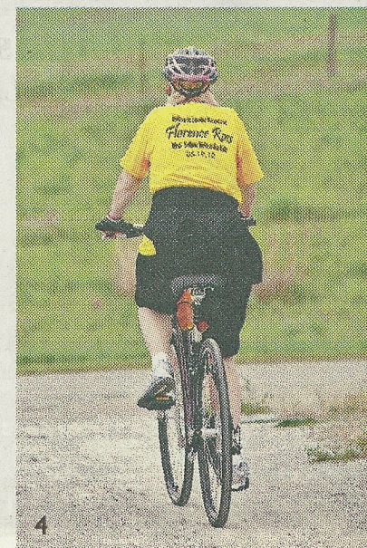
1 & 2) Riders braved the wind and raised $30,000 at the Wear Yellow Ride to help cancer patients and their families. 3) Wear Yellow Nebraska is a local grassroots organization fighting cancer through advocacy, awareness and fundraising. 4) Many participated in the Wear Yellow Ride in memory of a loved one who died of cancer.