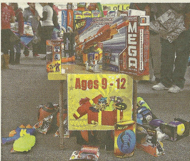
Volunteers set up the store with gifts divided into age categories. Shoppers could easily find toys, books, clothing, accessories and even bicycles for all ages.

Arias, waltzes, pranks and polkas! LSO's season finale includes excerpts from Mozart's Don Giovanni and The Marriage of Figaro , as well as masterpieces by both Johann and Richard Strauss.