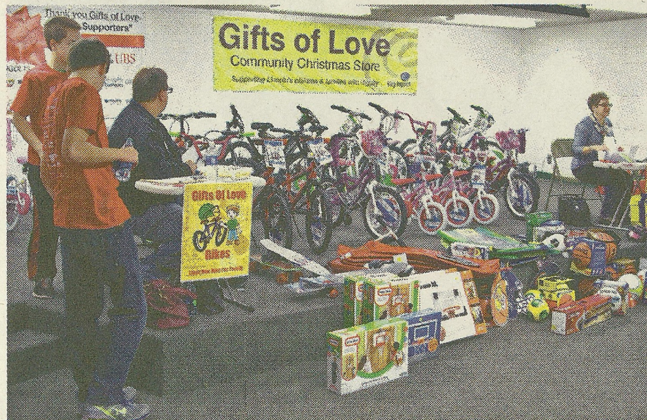
From small, beginner bikes to full-size teen/adult models, the Gifts of Love Christmas store makes buying a brand new bicycle a reality for shoppers.

This year, more than 1,000 volunteers gathered to make the 17th annual Christmas store a success. Nearly $100,000 in donations poured in to Gifts of Love, keeping the Christmas spirit alive for more than